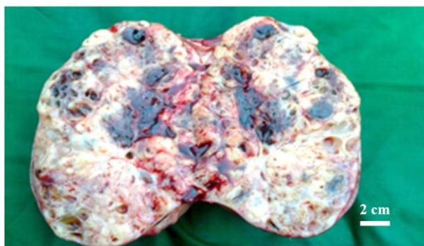
Figure 2. Multiple cystic compartments on the cross section of ovariectomized ovary with granulosa theca cell tumor

(Watson, 1999; McCue et al. , 2006; Gündüz et al. , 2010; McKinnon and Barker, 2010) which stated that a horse with GTCT on one of its ovaries usually followed by hypofunction of contralateral ovary. Proliferative granulosa cells secrete inhibin which affects the low level of the FSH concentration, leading to atrophy of the contralateral ovary (Zelli et al. , 2006; Ellenberger et al. , 2007). This inhibits follicles to grow optimally which leads to infertility in mares and is shown by prolonged anestrus.