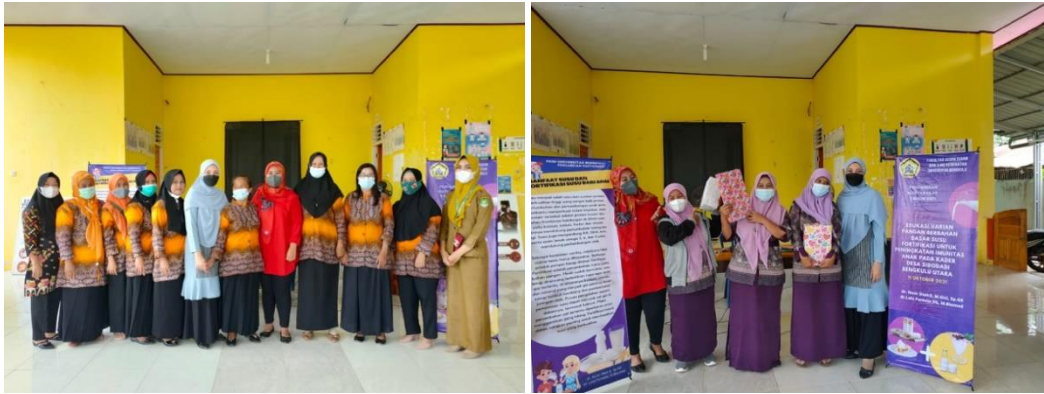
Figure 2. Documentation Community Service Activities at Sidodadi Village

The material was also conveyed through the provision of recipe books and photocopies of the presentation materials which were distributed to the participants. At the time of debriefing, the activity and enthusiasm of the village health worker was very good so that the debriefing of the time allotted was lacking. Most of the them in Sidodadi Village have been community provider for a number of years, so they have a lot of experience. The achievement indicator for this activity is the increased knowledge of village health worker to carry out education dan supervision in their working area. Based on the results of the satisfaction test, a value of 100% satisfaction was obtained for the activities. The suggestions that have been collected are the desire of the village health worker to continue to establish continuous activities and communication with the service team.