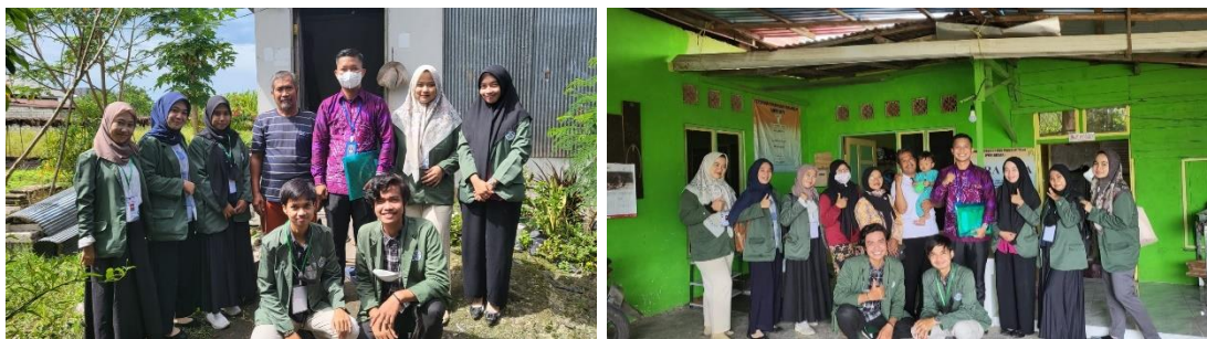
Figure 1. Intial Observation Activities

Education and Utilization of karamunting leaves as potential as herbal medicine in the community, is provided with leaflet media. The use of our Traditional Medicinal Plants to do Self Medication or self-medication is an effort made by ordinary people to overcome diseases or symptoms experienced by themselves or by those around them with their own knowledge and perception, without the help or orders of someone who is an expert in medicine or medicine [10]. Traditional medicinal plants are ingredients or ingredients derived from plants, animals, mineral preparations (galenic) or mixtures of these materials which have been used for generations for treatment according to the norms prevailing in society [11]. Initial observation activities can be seen in Figure 1.