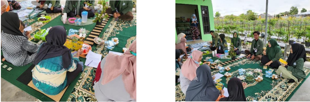
Figure 2. Educational Activities and Providing Leaflets

Giving leaflets is intended as a median for providing additional information at an extension, the community is given material directly and discussions about the potential of the karamunting leaf plant which is efficacious as traditional medicine [13]. The community was very enthusiastic about participating in this community service activity, and after the discussion the community realized that the plants they planted in their yard had properties as herbal medicine. The community service team also provided karamunting seeds for the community to plant. In addition, [14]; [15]. reported, in traditional Chinese medicine, Karamunting seeds can cure diarrhea. In Malaysia, the decoction of the leaves can be drunk to treat stomach aches, while in Indonesia it is used to heal wounds by pounding the leaves and placing them on the wound [15]. People in the city of Tarakan, North Kalimantan Province, have also used this plant as traditional medicine for a long time.