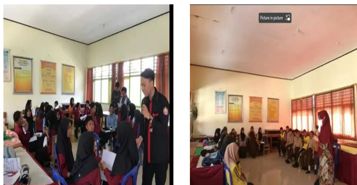
Figure 2. Group Formation and Matery Delivery

The head and members of the community service activities carried out activities to form a Youth Information and Counseling Center Group (PIK R) SMP 7 Sidoluhur Village.