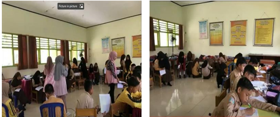
Figure 3. Post-Test

At the stage 2 mentoring, chairperson, members of community service activities and students assist in PIK-R activities which are held once a month in October to November 2022