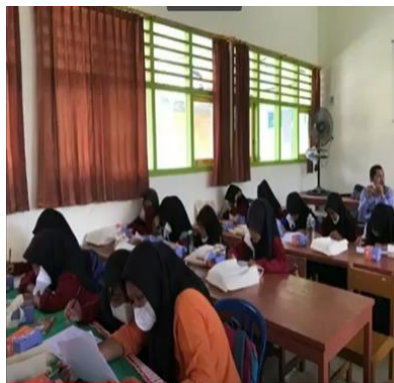
Figure 1. Pre-test

At the stage I socialization, members of the community service activities identified/assessed the problems faced by teenagers in Sidoluhur Village. Members of community service activities and students explore the extent of participation and contribution of partners in activities. The head and members of the community service activity conducted a pre-test of adolescents' knowledge about early marriage in order to improve their reproductive health.