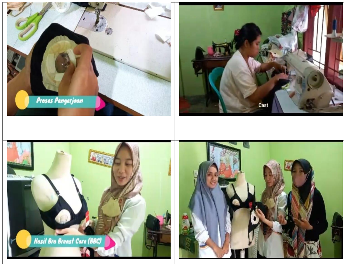
Figure 4. The BBC Tailoring Process is a nipple shield that is combined with a special breastfeeding bra to make it easier for mothers who have chafed, flat or immersed nipples to breastfeed their babies in the city of Bengkulu