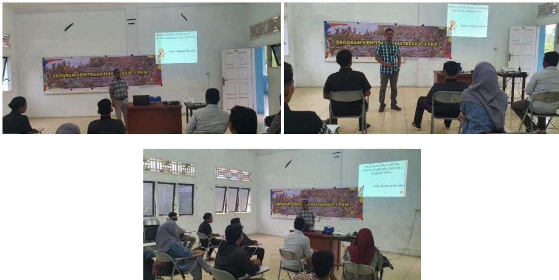
Figure 2. Digital Market Account Creation Training

Furthermore, at this meeting the IbM implementing team also discussed with partners regarding the activities to be carried out at the next meeting, in this case the activity agenda, Training on Using Digital Marketing Accounts, so that participants can prepare the time and tools needed at the next meeting. The following is the documentation of this activity: