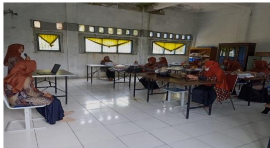
Figure 2. Program Evaluation Design Discussion

Third , Assignment collection and discussion. Each group of participants presented the results of the program evaluation design which were made in turn and discussed together to be discussed and get input for improvement from both participants and resource persons. The program evaluation design can be used and applied in each school.