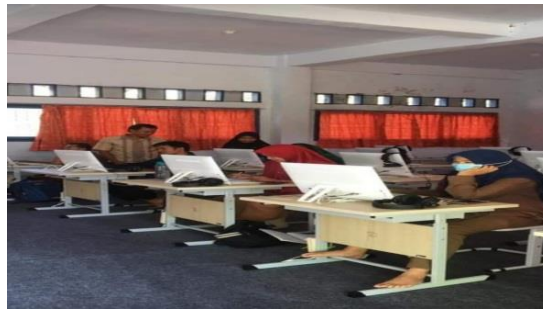
Figure 1. Practice preparing program evaluation designs

The implementation of community service was attended by Participants consist of the Principal, Supervisor, and Deputy Principal. First, providing material on program evaluation, program evaluation models, program evaluation designs. Participants are motivated to understand the importance of conducting program evaluations to determine the achievement of school goals and to identify obstacles encountered by schools and to make recommendations as a basis for developing school development for the following year. Second, the practice of compiling school program evaluation designs with the assistance of resource persons. Participants were divided into 15 groups and each group developed an evaluation design starting from the type of program to be evaluated, the type of evaluation used, setting the criteria for evaluation, and compiling evaluation instruments.