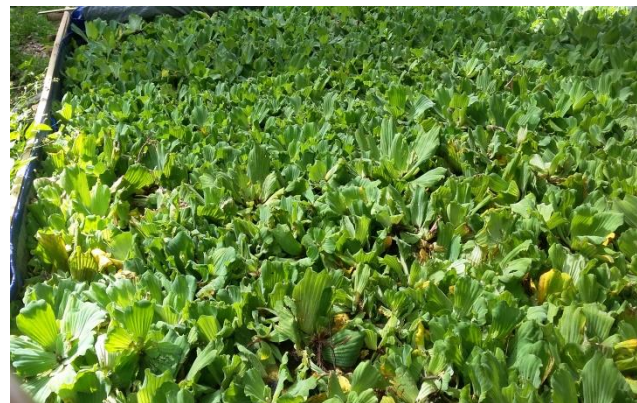
Figure 4. Pond of propagation/ mass production of biological control agents