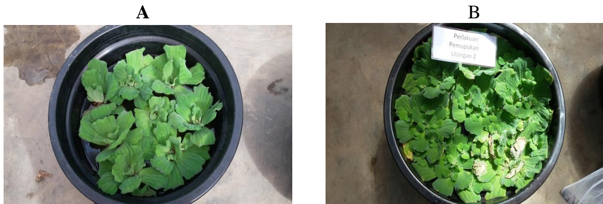
Figure 1. Water lettuce Weeds. A. Treatment without fertilization B. Treatment with fertilization