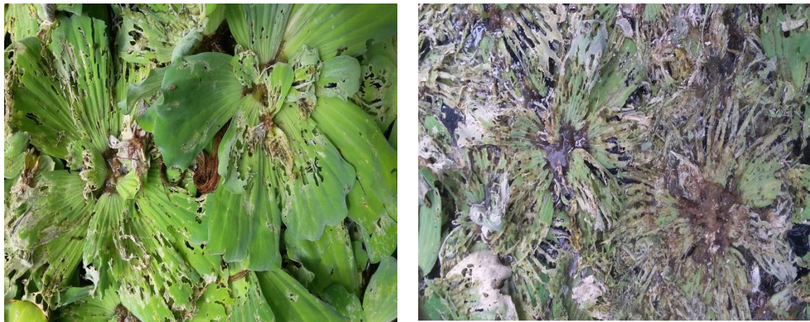
Figure 3. Damage on water lettuce due to the feeding activity of S. pectinicornis

The results showed that S. pectinicornis was capable of causing severe damage to the water lettuce with or without fertilization treatment, so the addition of feed and preparation of pupae stage were anticipated by the provision of fresh water lettuce. It reinforced the previous study, as stated by Ningrum (2015) that the damage suffered by the water lettuce in NPK fertilizer treatment with a concentration of 0.5 ml/l, 1.5 ml/l, and 2.5 ml/l had the respective percentage by 96.88%, 70.31%, and 62.50% while without fertilizer by 78.13%. It could be stated that the magnitude of the damage inflicted by S. pectinicornis was not affected by fertilization treatment on water lettuce.