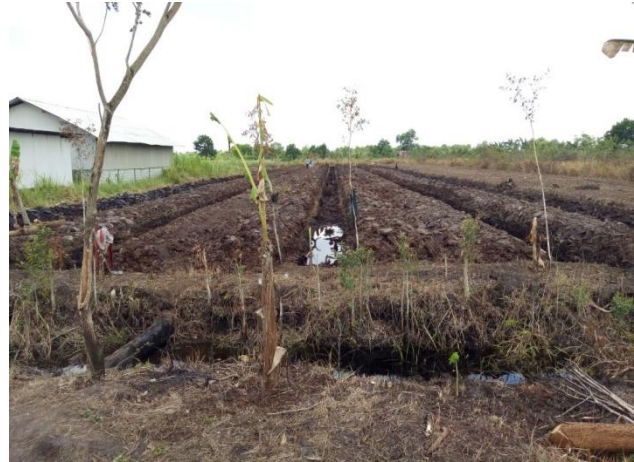
Figure 1. Wooden water gate (left) and canals at farm site (right)

The Plan includes the target of 2 m ha peat restoration in five provinces of which 200,000 ha peat restoration is to be carried out in South Kalimantan. The restoration task is supervised by five deputies of BRG. Among them, the research and development deputy is responsible for 35 research activities and five pilot projects. Execution of the projects has been maintained to be in line with other regulations, especially Governmental Regulation Number 71/2014 and Governmental Regulation Number 57/2016 that are on Protection and Management of Peatland Ecosystems.