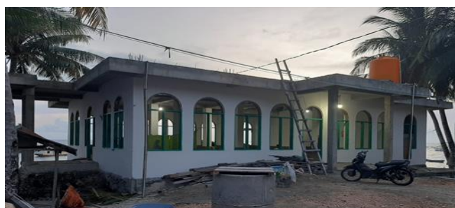
Figure 1. Model masjidi lantai 1 yang dibangun

The third nautical mosque has a size of 14.4m x 10.5 m with a total of 2 floors with the first floor already built and will proceed to the construction stage of the 2nd floor after the budget is collected. The picture of the mosque built for the first floor is as follows: