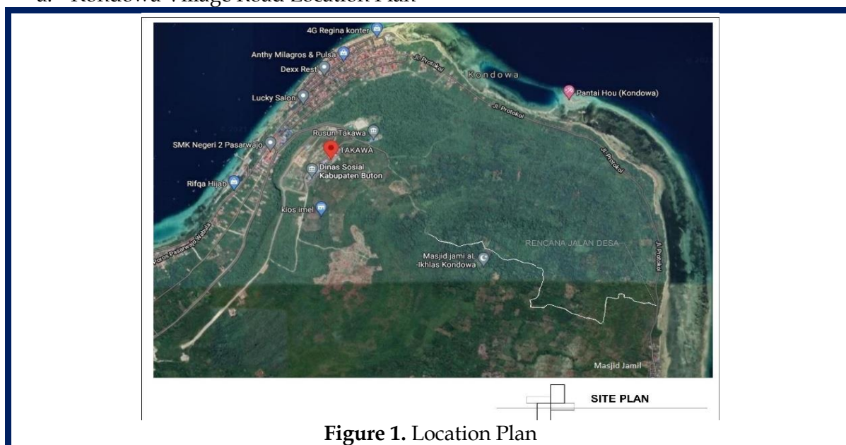
Figure 1. Location Plan

The results of field observations throughout the village area, point retrieval, and several other data obtained from stakeholders of related village equipment ((BPS, 2019), (Kondowa Village, 2019) as well as downloaded satellite images were then processed using the AutoCAD Application 2007. The existing data is then overlaid for the georeferens process, digitization of maps to the finalization of the Site Plan (site plan layout). In this activity, the map is placed with a scale of 1:1500 on paper measuring 1 x 1 m (scaled).