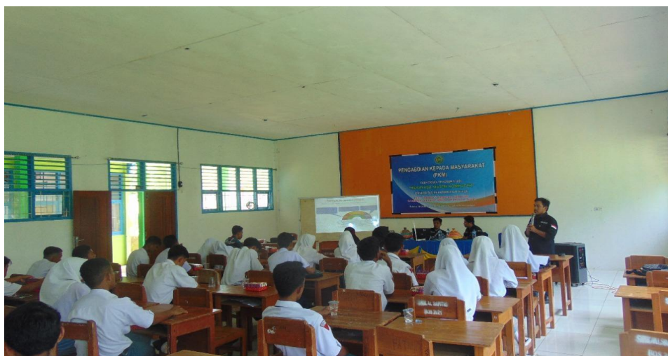
Figure 2. Presentation of Training Materials

E-learning application training was carried out in the multi-purpose room at AL-Safitri Vocational School which was attended by teachers and students which was previously opened by the principal of Al-Safitri Vocational School. The activity went well, namely the servant brought material using powerpoint, to be presented to the participants.