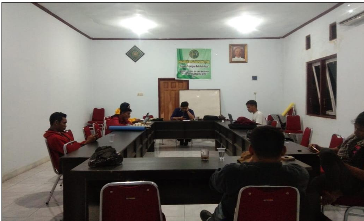
Figure 4. Second Meeting of Wondershare Filmora software practice

Understanding of information technology, in this case video editing training with Filmora, becomes very important because almost all sides of human life have been affected by information technology, so if we do not follow this influence, we will be left behind and everything will quickly become obsolete, and left behind.