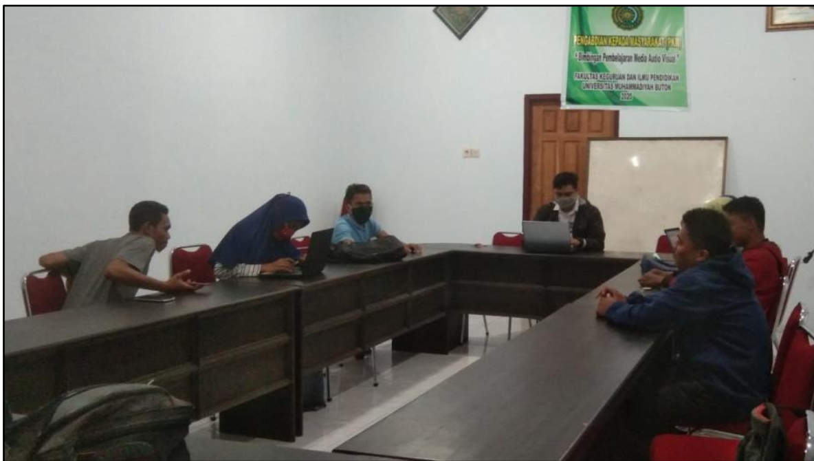
Figure 3. First meeting discussing Wondershare Filmora software

Audio Visual Media Learning Guidance using Wondershare Filmora software as Elementary School Teacher Professional Development in Murhum District, Baubau City". Based on the observations of the service team that until now in cluster 2 SD Batupoaro Subdistrict have not used Wondershare Filmora software as a learning medium in cluster 2 throughout Batupoaro District. Based on the foregoing, this service program aims to help increase the role of the Teacher Working Group Empowerment Team (KKG) Cluster 2 Batupoaro Baubau City in increasing the resources around them, improving learning media skills in accordance with the industrial 4.0 era as a whole. a) efforts that can increase the use of audio-visual media for teachers (b) efforts that can increase learning creativity in the professional development of elementary school teachers in Batupoaro District, Baubau City.