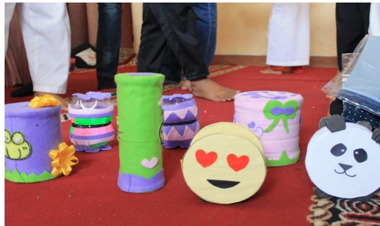
Figure 4. The Handycraft by Orphanage