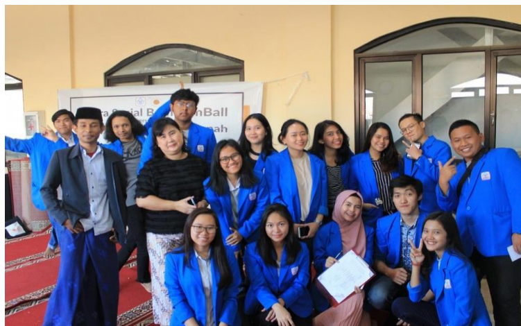
Figure 5. The authors and GIA Management

After the training event was over, the event was closed with gratitude from both parties and giving souvenirs, namely wall clocks and donations of money to the management of the GIA Foundation orphanage.