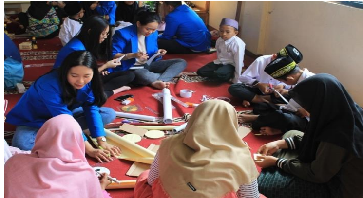
Figure 3. The Handycraft Training

freedom to make handicrafts based on the available materials. The best handicraft results are selected and get a gift in the form of writing instruments.