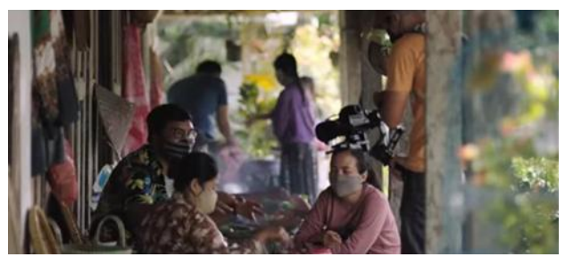
Figures 5. (Showing a scene in a traditional market that is bustling with people selling)