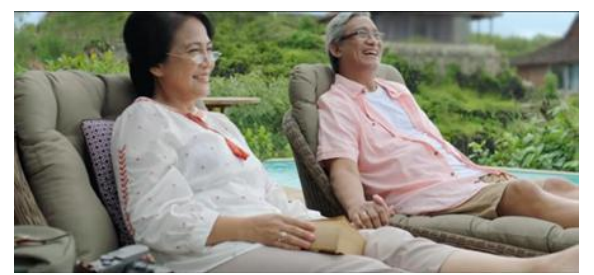
Figures 3. (Showing an elderly couple sitting and relaxing enjoying the good condition.)