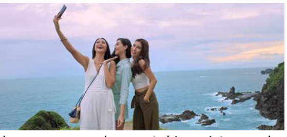
Figures 7. (Showing three women who are taking pictures above with a view of the beach.)