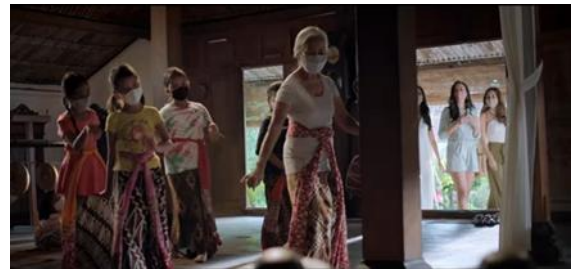
Figures 4. (Showing three women watching a group of traditional dancers dancing the 'Serimping Dance'.)