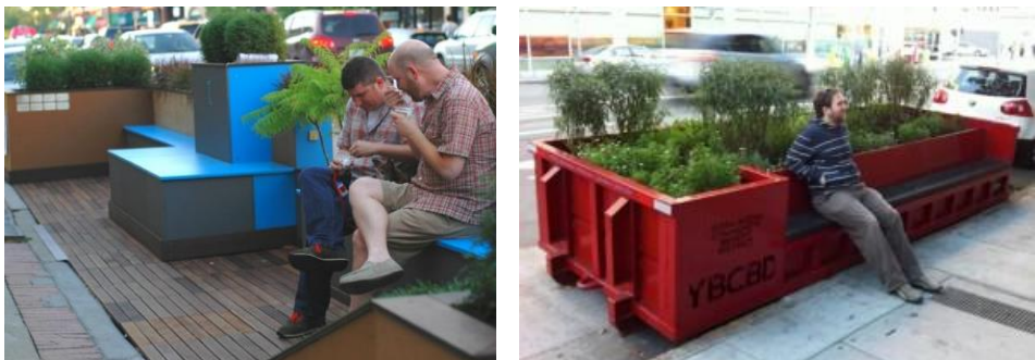
Figure 12. Design for Greeneries Integrated with Sitting Places

The walkways where the community uses for social interaction can be designed integrating the needs of greeneries within the neighborhood (see Figure 12). The vacant place can also be activated as urban farming function and public space with local identity for the community.