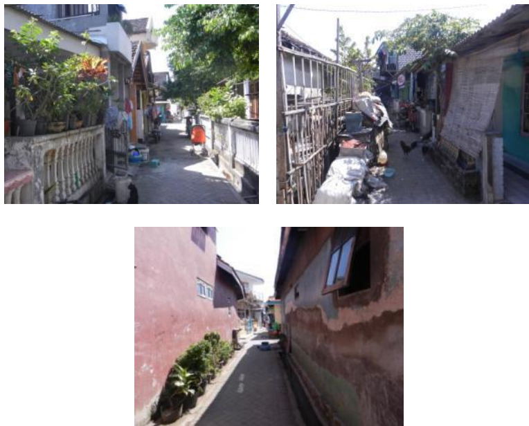
Figure 8. Existing Pathways in Kampung Kejawan Lor