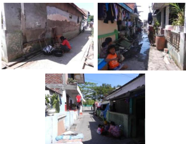
Figure 6. Daily Community Activities in Kampung Kejawan Lor

Source: map - modified from Google Map, 2013, photos – authors' photographs