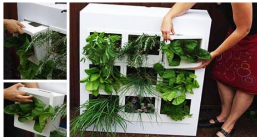
Figure 11. Hollow Block Wall Can be A Place for Plantation