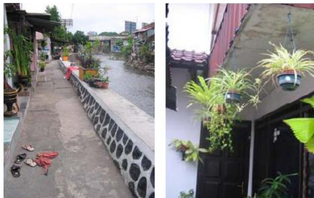
Figure 1. Pots are Used as A Plantation Media

To overcome the scarcity of land problem, the community used pots and hanging pots as a medium for plantation (see Figure 1). Plantation is placed in front of the individual houses as well as in common spaces such as the riverbank retaining wall. The existence of these plants creates a fresh and green ambience within the neighborhood.