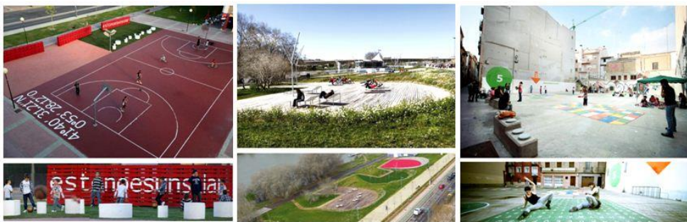
Figure 3. Optimizing Vacant Lot in Estonosunsolar-Zaragosa, Spain

The implementation of the program involved the Zaragoza Government as the initiator, the planning team, and the local community. In practice, the local people participated both in idea contribution and implementation of public space that suit their needs. The success of this project ultimately spread out throughout the city. There were some number of vacant lots that have been successfully converted into a children's playgrounds, basketball courts, urban gardens and squares, and they became a lively place and are well utilized by the community. The successful factor of this project is mainly due to good communication and cooperation between the government and the community. Direct community involvement from the beginning of the project, implementation and utilization foster a sense of ownership for the temporary created public open space. Sense of ownership and community participation are essential elements to achieve sustainable development.