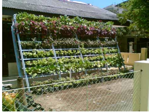
Figure 2. Vertical Urban Farming Functions as A Green Wall