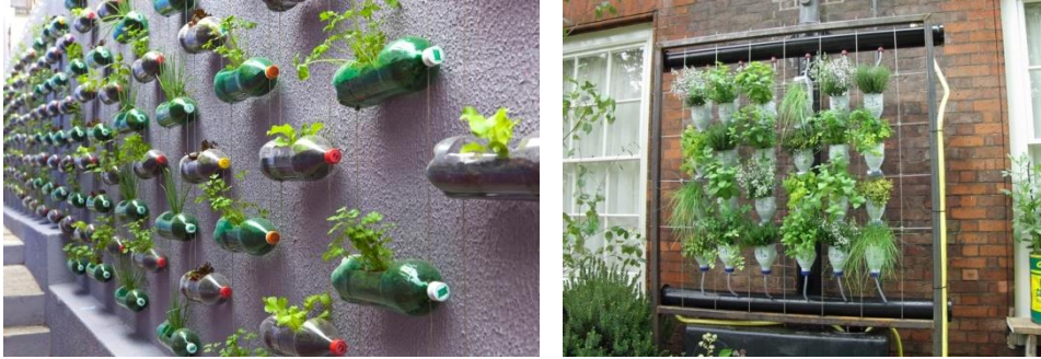
Figure 10. Some Examples of Vertical Garden