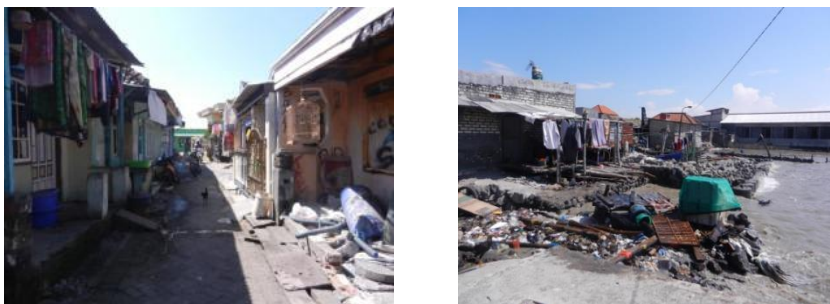
Figure 9. Slum Area of Kampung Kejawan Lor

Other issues raised from the case study is lack of hygiene which can be seen from trashes inside gutter and scattered in some parts of the settlements. Poor sanitary condition has made the impression of this settlement as a slum area and this is even worsened with the habit of drying clothes in front of their houses (see Figure 9). From the interviews with local residents, it is found that the garbage collection happened because of lack of environmental awareness. This can be seen from their habit of throwing households waste directly into sea. Those households waste then returned back to the settlement when high tide came. Besides, there is no proper waste management system for Kampung Kejawan Lor. Moreover, the community does not have a high level of education. Hence, the awareness for environmental concerns and hygiene are absent.