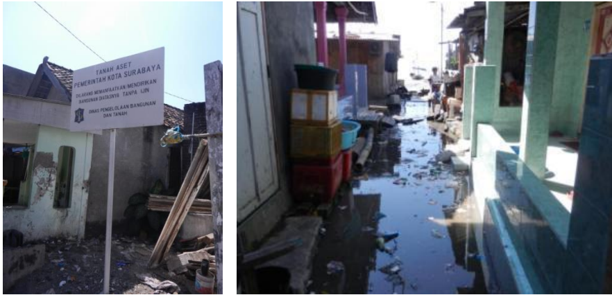
Figure 7. Open Space is Full of Garbage and Suffered from Flooding

trees planted by fraction of society. The trees and plantation do not function as a shelter, thus make the open space extremely hot during daytime. The only available vacant lot is owned by the Municipality and at the present condition is occupied with garbage (see Figure 7 left). Furthermore, the pavement which covers the pathways contributes in high temperatures in daytime and flooding since water cannot be directly absorbed by the soil (see Figure 7 right). The existing pathways can be seen in Figure 8.