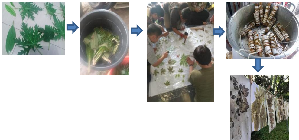
Figure 2. Stages of the Process of Making Eco Print Batik

In closing, below can be seen the various works of motif creation carried out by the training participants: