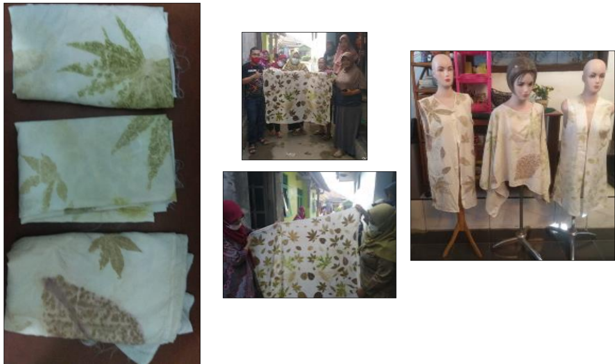
Figure 3. The Result of Eco Print Making From Materials to Products

In closing, below can be seen the various works of motif creation carried out by the training participants: