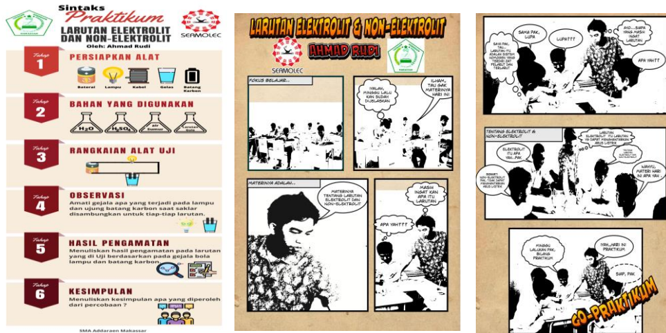
Figure 2. Infographics and Comic Life-Based Teaching Methods

The result of this research is the development of teaching methods using Infographics and Comic Life. This infographic and comic consists of practicum syntax and learning process syntax.