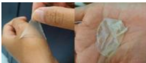
Figure 1. Peeling off the mask from skin

The peel-off mask formulation is thick in texture, white in colour, has a distinctive patchouli odour, is easy to use, and is easy to peel off when dry (Figure 1). The adhesive power of the peel-off mask formulation on the skin is good and can be peeled off when it is dry. Adhesion in this study was done by applying the gel to the skin on the back of the hand. The results of the adhesion test aim to show the ability of the preparation to adhere to the skin so that it can provide maximum effect.