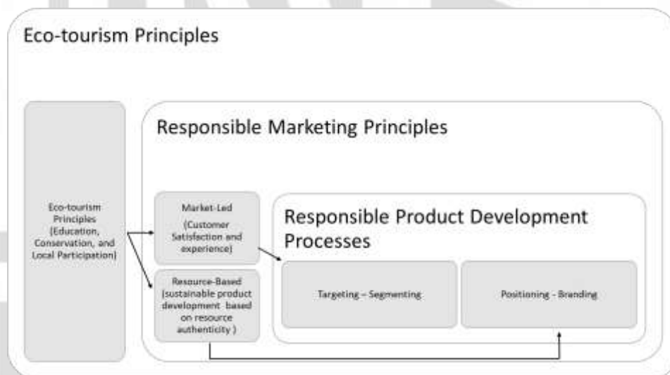
Figure 1. Responsible Marketing Model for Eco-tourism Product Development modified from various resources

Therefore, by referring to ecotourism definitions and principles, product development processes as part of a responsible marketing strategy would be limited to the context of ecotourism marketing. Consequently, a framework model is developed for this study to be used as a formula for responsible marketing strategy of ecotourism study.