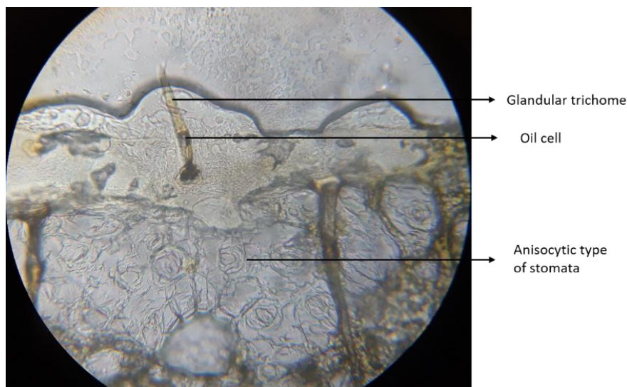
Figure 2. Stomatal type and glandular trichome of Pogostemon cablin Benth.

Data are means of five replicates. Means followed by the same letter in each column do not differ by Duncan's multiple range test at p \leq 0.05 . * and *** indicate significance at p \leq 0.05 and p \leq 0.001 , respectively