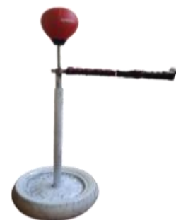
Figure 3. The Standing Punching Pad after Development