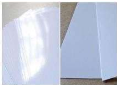
Figure 1. Ivory Paper

For the selection of packaging materials can use plastic, ivory the picture can be seen as follows.