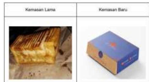
Figure 5. Comparison of Old and New Packaging of Ar-Fath Bakery

1. Based on the analysis and evaluation, it can