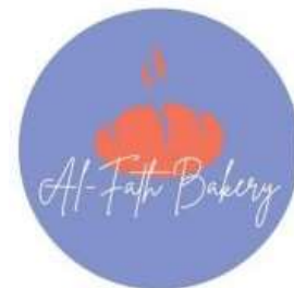
Figure 4. Ar-Fath Bakery Design Seal Logo