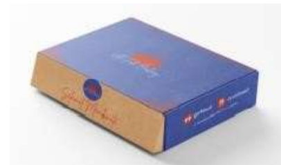
Figure 3. Ar-Fath Bakery's New Packaging Design