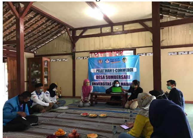
Figure 3. Implementation of Training with Micro, Small, and Medium Enterprises (MSMEs) Actors

The first meeting was attended by Micro, Small, and Medium Enterprises (MSMEs) actors from Summersari Village, Saradan District, Madiun Regency, East Java Province. This activity occurred on February 17, 2022. This activity was carried out at the house of one of the local village post in Summersari village. About 15 people attended this meeting. Figure 3 depicts documentation of activities at this first meeting: