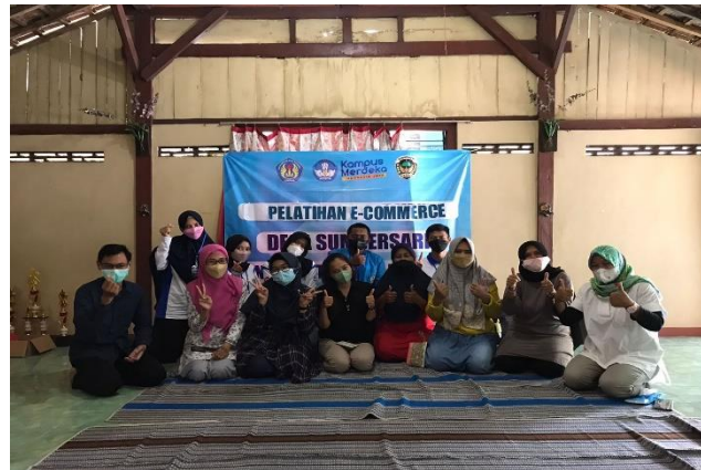
Figure 4. Closing of the training and group photo with Micro, Small, and Medium Enterprises (MSMEs) actors