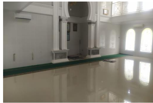
Figure 1.2. Indoor of the Yusrein Mosque

Building a mosque basically requires knowledge of how to manage a mosque. The modern management process that is widely used today is a beneficial tool in the mosque development process and is implemented by mosque administrators (Mannuhung & Tenrigau, 2018). For the mosque to benefit the surrounding community, the role and function of the mosque must be carried out. This will not work unless there is excellent and regular management. To maximize the process of building the mosque, Masjid Welfare Council (DKM) must focus on three aspects, including management aspects ( idarah ), fostering the prosperity of the mosque ( Imarah ), the maintenance