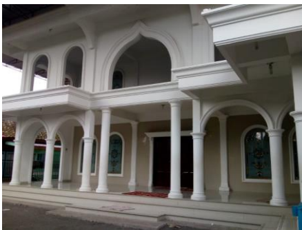
Figure 1.1. The front of the Yusrein Mosque

This research was carried out in the Orang Kayo Hitam Village, precisely at the Yusrein mosque. Yusrein Mosque was built in 1972, with an age of 49 years. In 2015 this mosque underwent a total change from a physical point of view, which was initially a tiny plank building to a magnificent and more comprehensive 2-story building with a capacity to accommodate worshippers of approximately 50-60 people. This building has brick walls painted white with a height of roughly 15 meters. The Yusrein Mosque has undergone at least two physical changes to suit the community's needs by not eliminating its primary role. The location of the Yusrein mosque is not too far from the Magat Sari Grand Mosque, namely in the Orang Kayo Hitam village, Pasar sub-district, Jambi. The Yusrein Mosque is also not that wide when compared to the Great Mosque. Right in the courtyard of the mosque is the main road for the community and not far from the market center so that almost every time the congregation prays this mosque quite a lot. With a reasonably strategic location, the Yusrein mosque is easy to find, and this has an impact on taking pictures that have problems, as shown in Figure 1.1 and Figure 1.2 below.