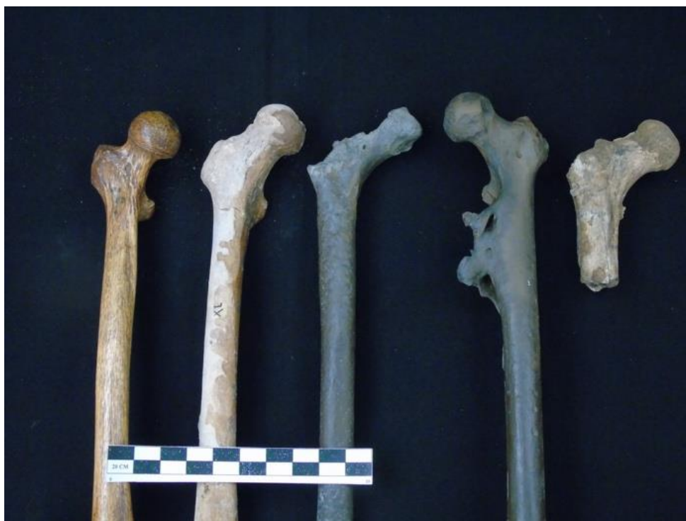
Figure 1. Comparison of femur: 1. Modern Homo sapiens (original), 2. Prehistoric Homo sapiens from Gilimanuk (original), 3. Homo erectus Trinil 2 (replica), 4. Homo erectus Trini 1 (replica) and 5. Banjarejo hominin (original)

Measurements on the femur diaphysis of Banjarejo specimen cannot be done using the classic morphometric variables proposed by Martin and Saller (1957) due to the conservation condition of the specimens. However, several measurements could be made based on the technique proposed by Ruff (2003) on the 60% - 80% segment of the diaphysis, including (Table 3).