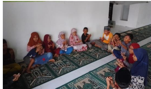
Figure 4. Evaluation