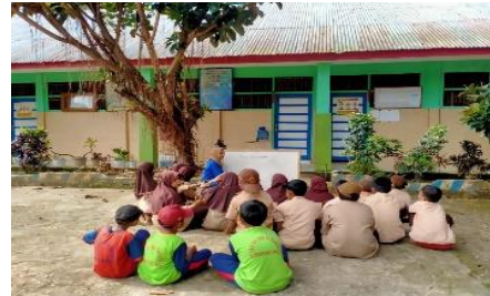
Figure 2. Addition and subtraction