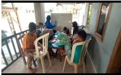
Figure 1. Introduction to Jarimatika

it has had an influence both in terms of its activity and responsiveness. The place and time of learning is also very influential for children. Therefore, the learning process that is applied is outdoor so that they can feel a new and not monotonous atmosphere, because learning can be done anywhere and anytime.