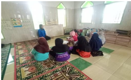
Figure 3. Multiplication and division