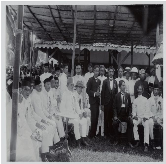
Figure 2. Meeting of the Establishment of the Sarekat Islam Branch in Blitar