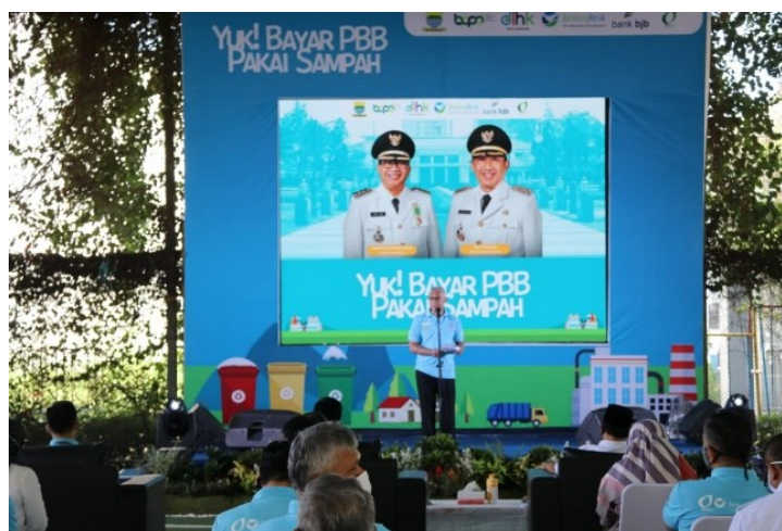
Fig. 1. Socialization of Tax Payment Innovation with Waste

The need for non-cash tax payments is a solution to prevent physical contact, including for PBB payments. The Bandung City Government is collaborating with Bank BJB 10 as a Bank for PBB Payments, so it needs a PBB payment feature that can support interbank transfers. QRIS and Virtual Account (VA) are a form of non-cash transactions chosen as a solution for PBB payment transactions to avoid physical contact during the Covid-19 pandemic. With QRIS and VA, all payment applications, both Bank and Fintech, will be able to be used to make PBB payment transactions. See Fig. 1 for the socialization process.