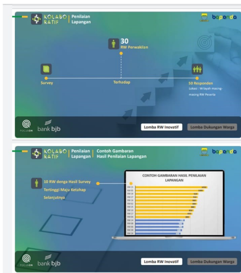
Fig. 4. Community Competition Results

Several similar studies have shown that various innovations in PBB payments tend to increase the income from PBB [12, 13]. The change in people's attitudes in understanding the PBB with these innovative activities led to the awareness to pay [14] even though during the Covid-19 pandemic there were some declines due to the difficult economic situation [15]. These results are also consistent during the PBB payment innovation activities in the city of Bandung.