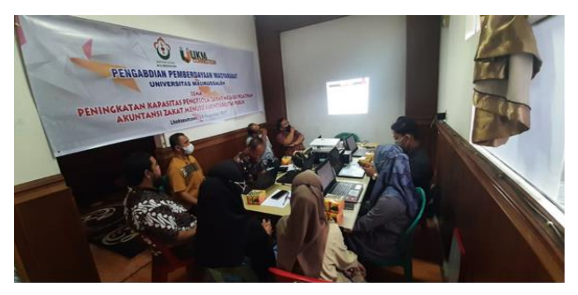
Figure 2 Discussion

From the results of discussions and sharing with participants during the implementation, it can be mapped that their weaknesses and shortcomings in understanding zakat accounting standards are in accordance with PSAK 109. The root cause is firstly, many zakat administrators (amil) do not have an accounting background or an economic background. The two records that they do are limited to cash inflows and outflows, thirdly they have not prepared periodic financial reports for managing ZIS funds.