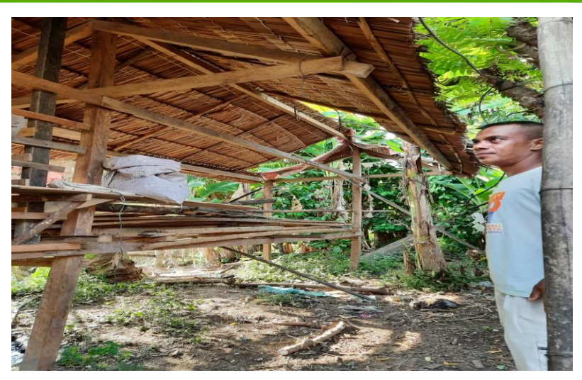
Figure 3. Fattening Cage

https://radiapublika.com/index.php/IRPITAGE