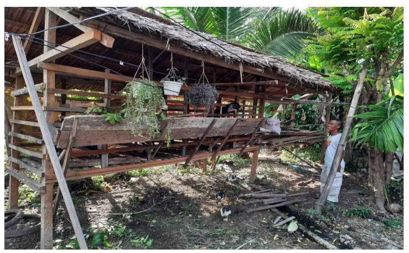
Figure 1. Fattening Cage

Author: Umaruddin Usman, Erlangga, Likdanawati, Azizi Ramadhan, Firli Ariski