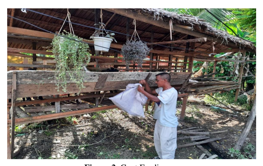
Figure 2. Goat Feeding

On Figure 1 shows that the condition of the goat cage is still simple and less than feasible. For every income from the sale of goats, UD Sijahtera must set aside its income for daily household needs and renovate the damaged goat cages. Renovation of goat cages is only done modestly according to the existing budget. The maintenance of beef cattle with the traditional system causes a lack of the role of breeders in regulating the breeding of their livestock (Novarista, 2020).