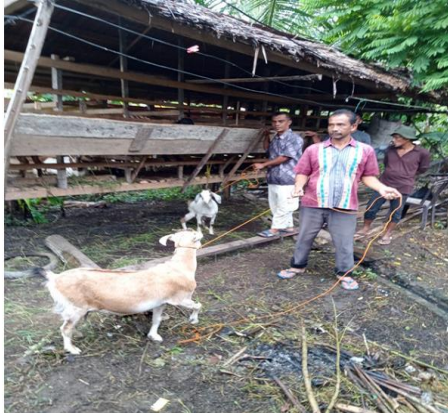
Figure 5. Treatment Process

The maintenance process is carried out by (1) providing feed, vitamins and vaccines. The amount and quality of feed must be considered. Goat feed is in the form of forage and concentrates. The amount of daily feeding is about 10% of body weight. In addition, it is necessary to give reinforcement feed as much as 1% of body weight. (2) cage. A good cage must be made of strong material so that livestock can be kept safe (Month, 2019). A good cage system is a stage system where goat dung is much easier to clean (Suherman, 2017).