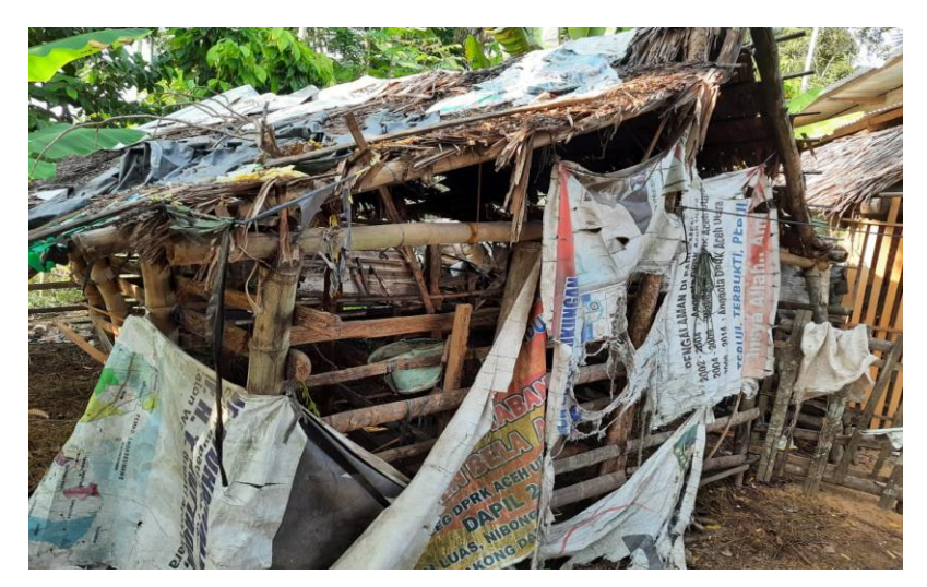
Figure 4. Special Cages for Mating, Childbirth, and Breastfeeding

On Figure 3 saw the renovated goat fattening pen and additional space for goats to be fattened. The work has stopped for the last 1 (one) month.