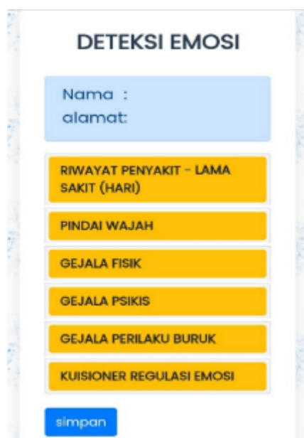
Figure 2. The SIDE Application Features

Further explanation of each feature is described below.