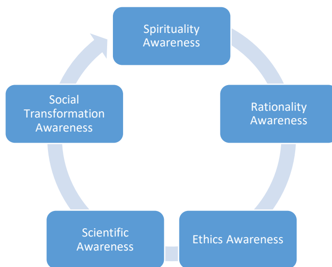
Fig 2. Ethical Values in QS al-'Alaq 1-5

Sociologically, awareness to overspread knowledge widely based on Al-Qur'an brings individually, socially, and culturally changes or transformation in line with the goals of Al-Qur'an. 40 The conclusion is that God is as a source of knowledge who taught Al-Qur'an at that time to the Prophet Muhammad. Humans have been given the potential to know and to use their minds, hearts, and senses to read the instructions of life, which is already written in Al-Qur'an. Moreover, deep reading will also create knowledge. At the end, humans are required to make social changes with science. The fifth verse gives a signal to the social transformation awareness to the ideal goals of Al-Qur'an, rahmatan lil alamin .