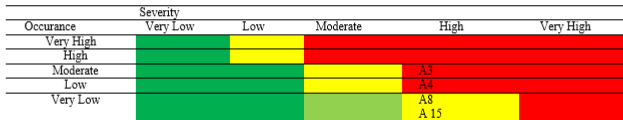
Figure 3. The Risk Mapping After Identification

House of Risk Phase 2 is a follow-up on Phase 1 and involves the mitigation of the dominant risk result gained from HOR 1. Phase 2 is a risk mitigation strategy determined by focus group discussions with experts from each supply chain.