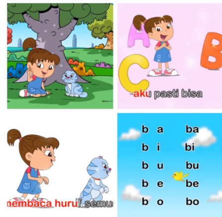
Figure 1. Animated video display

In this study, the animated video media used will be adapted to the material that will be taught to dyslexic students, namely reading nouns that contain the letter E and letter F.