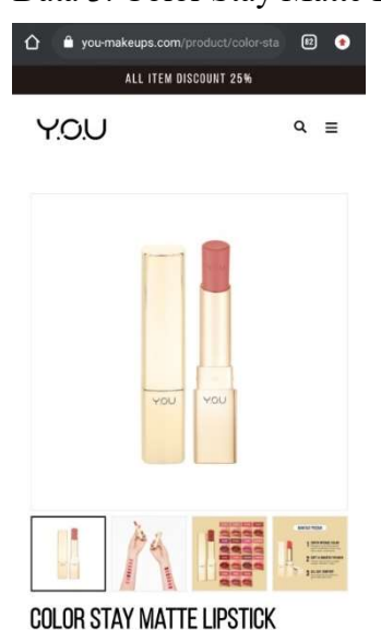
Data 3. Color Stay Matte Lipstick

The slogan enlarge to share informations to the consumers which the product is a kind of matte lipstick. Matte lipstick means the lipstick is smooth, and sultry, and offer long-lasting, smudge-poof and waterproof color that is often no possible with classic lipstick that still attend from eating, drinking, and anoter activity that can erase the lipstick