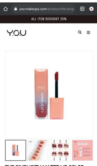
THE SIMPLICITY MATTE LIP COLOR