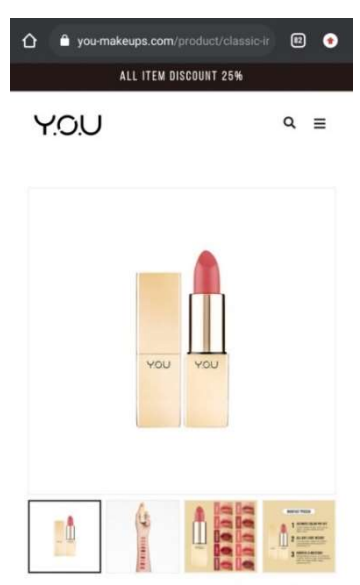
CLASSIC INTENSE MATTE LIPSTICK

This is meant that the slogan looks like simple but the message is not easy to be understood for ordinary people. In spite of ordinary people do not understand well the meaning of the slogan, but they are able to be interest when they read the slogan. Because the slogan used by the advertiser convinces the consumers. In order that, when the consumers buy the product and get the benefits as the slogan stand out, the consumers are able to take a response which the slogan informs the product features as fact as the quality of the product. Therefore, the slogan used explains the name products, field of operations, and the characteristics of it.