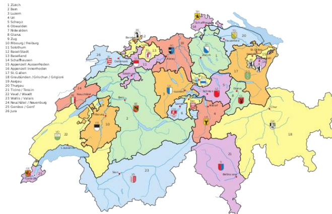
Figure 1. Switzerland (Karza, 2008).

in the world, a life expectancy of 83.6 years, and a per capita income of USD 59,375 (UNDP, 2020), Switzerland deserves to be used as a benchmark for educational curriculum, especially in the field of mathematics education.