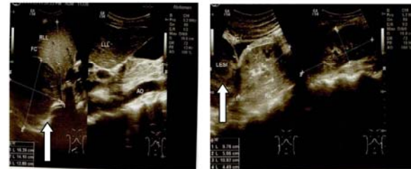
Figure 2. Abdominal ultrasound showing a solid, heterogeneous and hypoechoic mass, clear border, almost at all of the right lobe, including segment 5,7,8, with impression of adhering to right diaphragm. Size \pm 14.18x8.56x12.56 cm, with vascularization inside the mass. Portal/vascular/biliary system was not dilated.

Laboratory examination revealed no significant findings, with hemoglobin level 13.8 g/dL, white blood cell 13,640/ \mu L without blast cell, thrombocytes 523,000/ \mu L, AST 46 U/L, ALT 18 U/L, albumin level was 3.0 g/dL, AFP 2.2, LDH 732 IU/L, with non-reactive result of hepatitis B and C marker. The abdominal ultrasound and CT-scan revealed a mass sized 14.18x8.56x12.56 cm as shown in Figure 2 and 3.