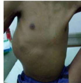
Figure 1. Patient looked cachectic, with mass bulging at his right upper abdominal area

irregular surface, rounded edge, indefinite margin, immobile, without tenderness in palpation. Other physical findings were within normal limit, without any lymphnode enlargement at other sites.