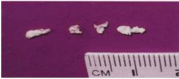
Figure 2. Macroscopic appearance of intestinal mucosa biopsy which was performed in several places