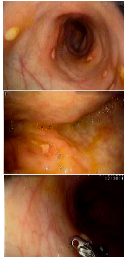
Figure 1. Colonoscopy results showed multiple ulcer and hyperemic mucosa

3+, 10x = epithel 1-2/SPF, 40x = erythrocyte 40-50/HPF, leukocyte 2-4/HPF. Complete faecal analysis, white in colour, soft consistency, epithel 1+/HPF; leucocyte 0-2, cyte 2-4, Entamoeba hystolitica cyst was identified. Faecal culture results showed Enterobacter gergoviae strongly sensitive to colistin, cotrimoxazole, amoxycillin and clavulanic acid, ceftriaxone, and gentamycin antibiotics.