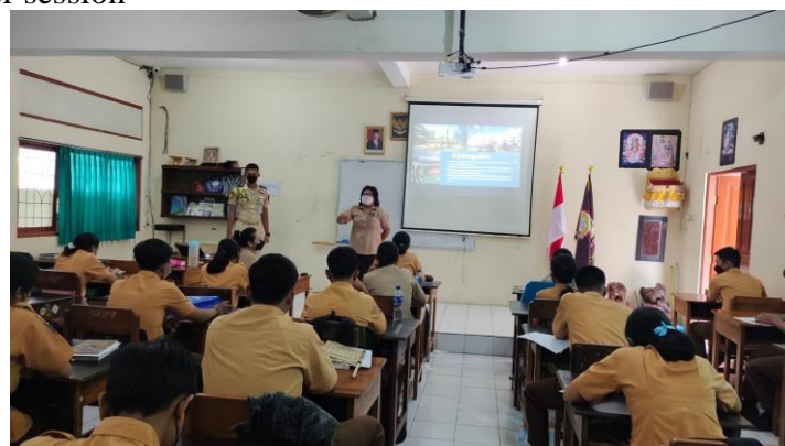
Figure 5. Q&A documentation