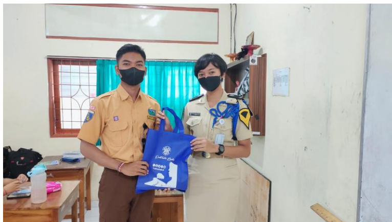
Figure 6. Souvenir Documentation

In the socialization activities, apart from providing material, post-test and pre-test were also given to measure students' abilities. Based on the results of the post test which consists of 5 multiple choice questions, done for 20 minutes, it is known that the average score of students is 88. Meanwhile for the pre test with 10 questions, the average score is 52.78. Thus, it can be concluded that the use of this media can help improve students' understanding of the rules for using public transportation, even though this is new material for them.