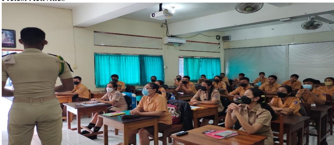
Figure 2. Documentation of Pre-test Activities