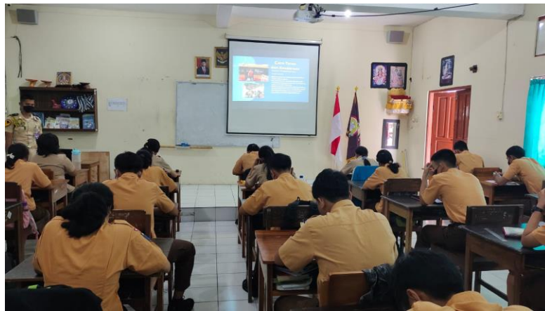
Figure 4. Documentation of Extension Activities