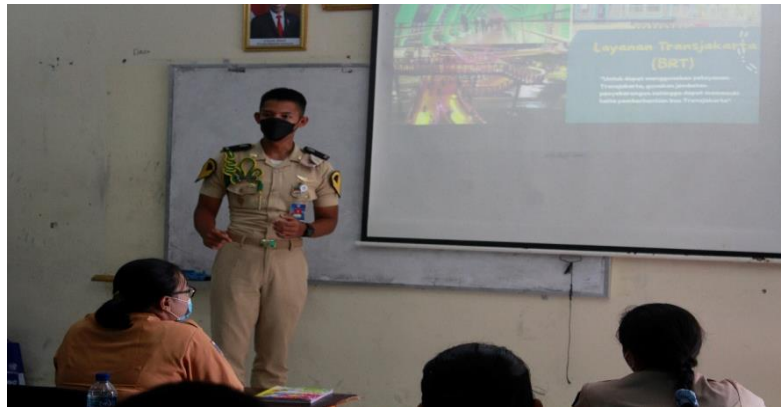
Figure 3. Documentation of Extension Activities