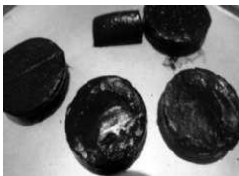
Figure 6 The process of printing and pressing briquettes