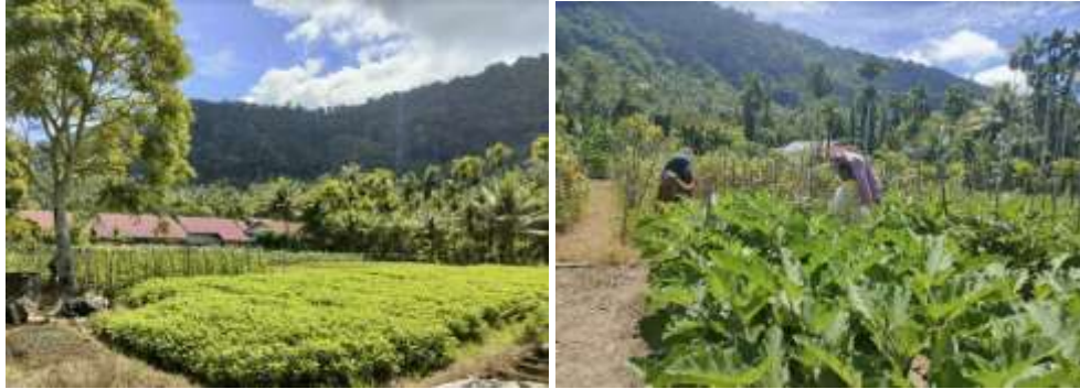
Figure 5 The topography of Balohan Village is mountainous and hilly.

plains, 14.10% steep. The slopes of Balohan Village as the research location vary greatly, namely very steep topography >40 % (108.52 ha), mountainous 15 40 % (410.33 ha), wavy 5 15 % (177.31 ha), and sloping 2 5 % (76.25 ha) (Sabang City Government, 2012). These varied slopes provide a beautiful view of the hills as well as an attractive visual value for visitors. (Figure 5).