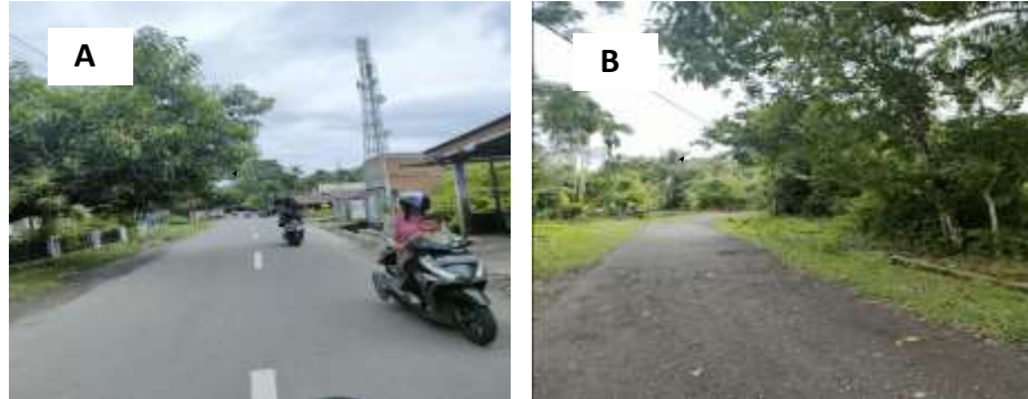
Figure 3. (a) Condition of connecting roads between villages (b) road to agrotourism

of ornamental plant sales, so the road looks deserted. Access is a very important aspect that needs to be considered in supporting agro-tourism areas for visitor facilities.