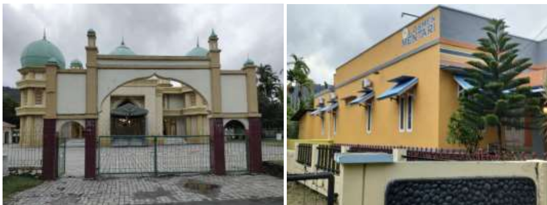
Figure 4 (a) Mosque (b) inn

Public facilities in the agro-tourism area are government facilities, village offices, roads, education, health, mosques, clean water, electricity and energy. The utilities in Balohan Village are the electricity network, water, wells, PDAM and water needs are fulfilled because they use springs. Supporting facilities for tourism activities are already available at the research site, such as mosques and inns (Figure 4). However, there are still lacking facilities to support agro-tourism such as unattractive resting places, souvenir stalls and cleaning facilities around the site.