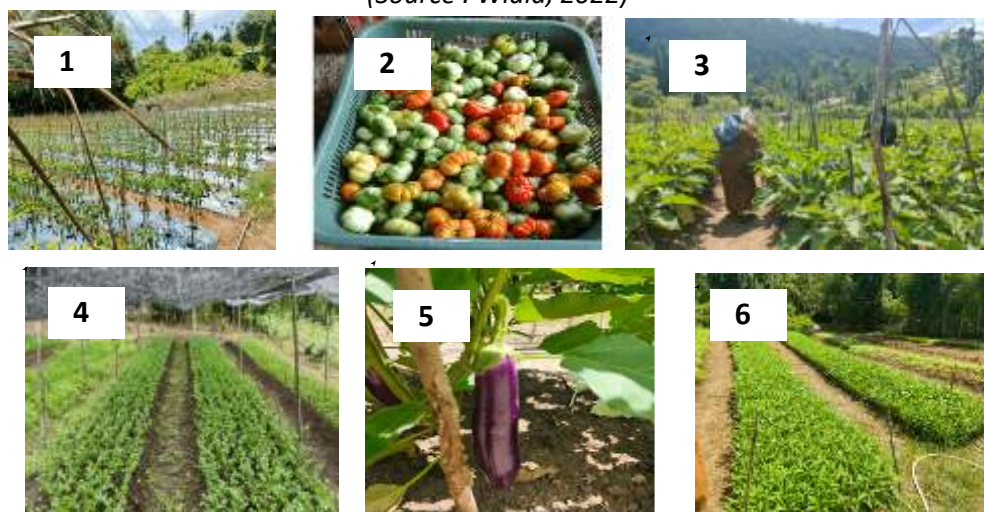
Figure 7 3. (1,2,3,4,5,6). Vegetable and Horticultural Garden