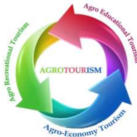
Figure 1. Agrotourism Scheme