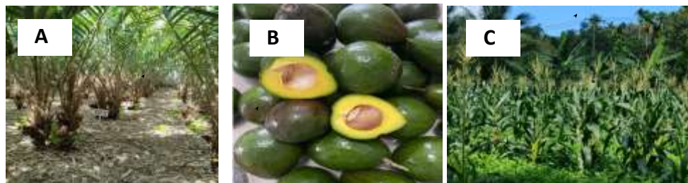
(A,B) Fruits, dan (C) Palawija