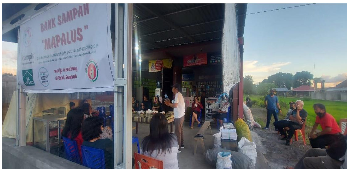
Figure 2 Mapalus waste bank customer meeting

The analysis of the indicators of the source of the observed waste concluded that it came from household waste, such as: plastic food wrappers, plastic bottles, glass bottles, cans, and paper, both newsprint, HVS, and cardboard. In Indonesia, the classification of waste that is often used is as (a) organic waste, or wet waste, which consists of leaves, wood, paper, cardboard, bones, leftover fodder, vegetables, fruit, and as (b) inorganic waste, or dry waste consisting of cans, plastic, iron and other metals, glass and mica.