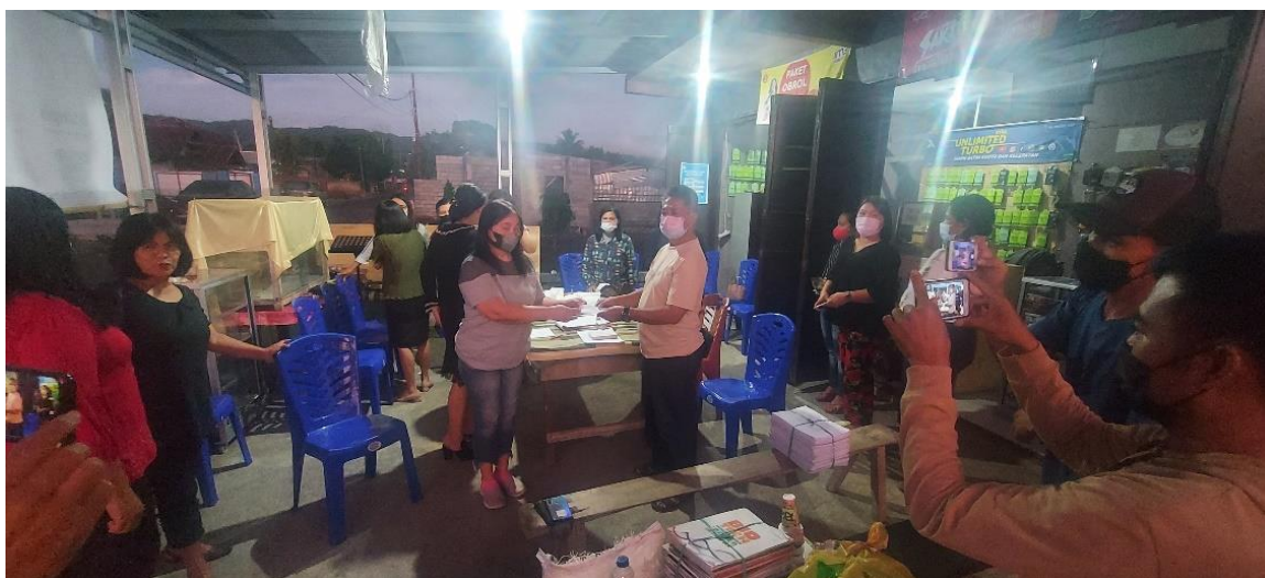
Figure 3 The process of saving at the Mapalus waste bank

Waste bank in principle is a social engineering to invite people to sort waste. The implementation of a waste bank can provide real output for the community in the form of job opportunities in carrying out waste bank operation management and investment in the form of savings. The community can take advantage of the waste bank program because the community and producers can work together with existing waste banks to process waste (Suryani, 2014). The application of the 3R (Reuse, Reduce, Recycle) strategy in waste management at the source at the community level will encourage an effective and efficient waste bank mechanism. Based on this understanding,