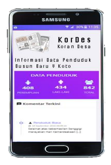
Figure 5. Villager Data Interface KorDes application

boundaries according to the coordinates and scale of the village area and the area within the village.