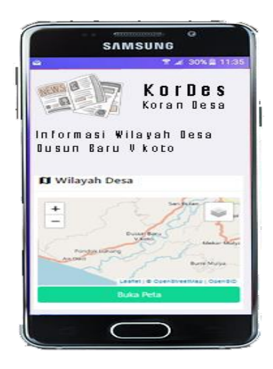
Figure 4. Village Area Info Menu Interface KorDes application

In Figure 3. Above is the display of the main page or main menu of the Kordes application after being selected by the user. The main page will contain the latest news about what is happening and about developments in the village so as to provide straightforward and fast information to people inside and outside the village.