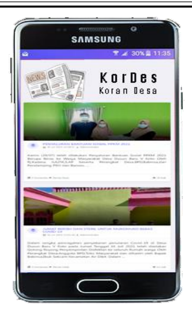
Figure 3. The Main Page Interface of the KorDes application

In Figure 3. Above is the display of the main page or main menu of the Kordes application after being selected by the user. The main page will contain the latest news about what is happening and about developments in the village so as to provide straightforward and fast information to people inside and outside the village.