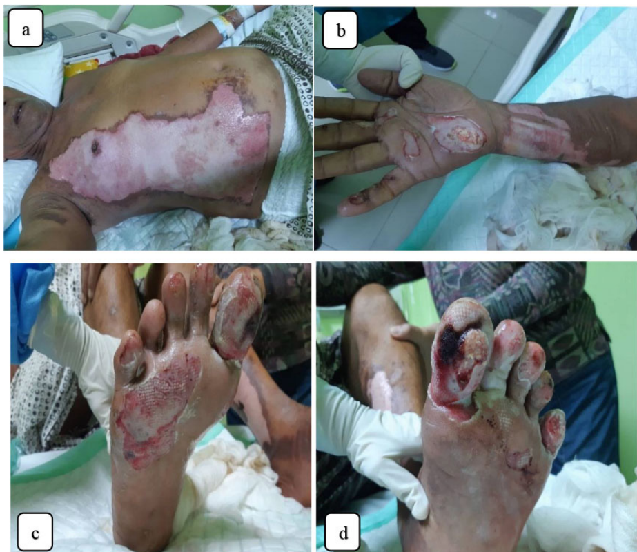
Figure 3. Post debridement (a) regio thorax anterior dextra Grade II A-B (9%); (b) regio digiti III & V, palmaris, antebrachia dextra Grade II B (4,5%); (c) plantar pedis dextra and digiti I-V Grade III (4,5%); (d) plantar pedis sinistra and digit I-V Grade III (4,5%).

fluid administration. By using the Baxter formula, for fluid administration in the management of burns, given 7200 cc of ringer lactate fluid in the first 24 hours, which in the first 8 hours was given 3600 cc and for the next 16 hours had to spend 3600 cc of ringer lactate fluid. And urine