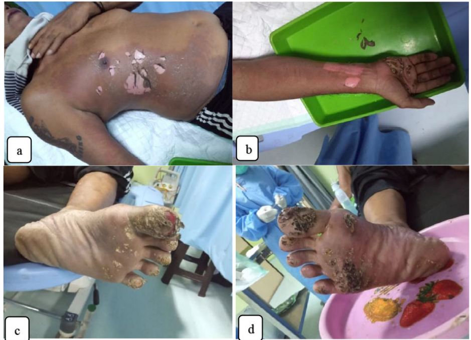
Figure 1. Burn Injuries on the patient (a) regio thorax anterior dextra Grade II A-B (9%); (b) regio manus digiti III-V, palmaris, antebrachia dextra Grade II B (4,5%); (c) plantar pedis sinistra and digiti I-V Grade III (4,5%); (d) plantar pedis dextra and digiti I-V Grade III (4,5%).

A 70 years old man came to the emergency room at Panti Wilasa Dr. Cipto Hospital, Semarang, approximately 30 minutes after the incident. His friend accompanied him with a chief complaint of burns due to high-voltage electrical shock. The patient had a history of electrical shock when fishing on the side of the river bank, where there is a high-voltage electric central behind him. When he threw his fishing line, the fishing line caught on of the exposed high-voltage transformer cable and hit one of the patient's body parts, causing an electrical shock. The examination obtained blood pressure of 180/90 mmHg, heart rate 73 times per minute, respiratory rate 20 times per minute, oxygen saturation of 99%, axillary temperature of 36,7 Celcius and weight of 80 kg. In the primary survey, obtained airway was cleared with spontaneous breathing, in circulation CRT < 2 seconds, normal skin color, good skin turgor, and no bleeding, conscious with a good response from the patient, pupil isochore (+/+), reflex (+/+), exposure not found any burn-in back side. The secondary survey had burn injuries on the right chest to the abdomen, palm to the right hand, and both soles of the feet. Another complaint is a pain in the