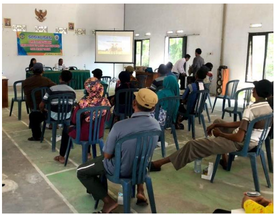
Figure 1 Implementation of Socialitazation Activities