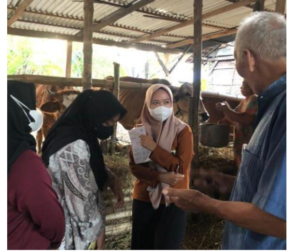
Figure 2 Implementation of Monitoring and Evaluation Activities

The results of a survey of the willingness of their livestock farmers to be vaccinated