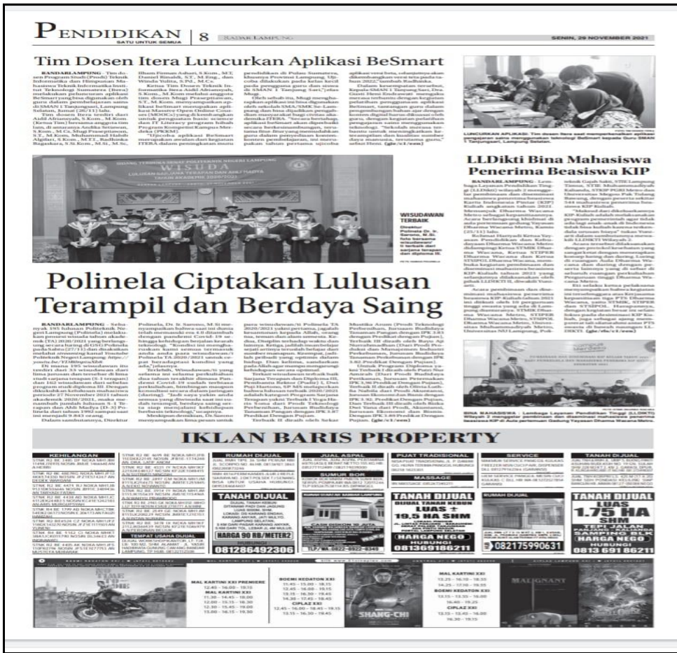
Figure 6. Media Publications

The output in the form of a video documentation can be seen on YouTube with the link: https://www.youtube.com/watch?v=y1gB87rUnCY. As for media publications, it can be seen in Figure 8.