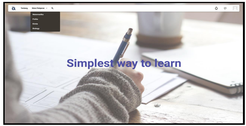
Figure 5. Main Display of the BeSmart Application

In accordance with the planned output targets, namely applications, PkM journals, video documentation, and media publications. In its implementation, the planned targets have been successfully implemented in the form of applications, PkM journals, video documentation, and media publications. The display of the BeSmart application can be seen in Figure 5 and Figure 6.