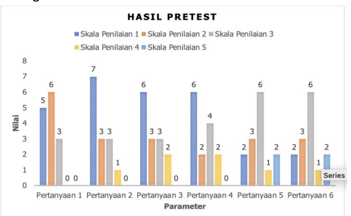
Figure 9. Graphic Visualization of pre-test results

The visualization chart for the pre-test can be seen in Figure 7 and the visualization chart for the post-test can be seen in Figure 8.