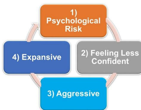
Figure 2. Negative Risk Management

To assess the negative risks described above, mitigation or action plans must be carried out in the form of implementing more consistent administrative evaluations and establishing TeFa. As for negative risk management, if TeFa is not carried out in SMK N 1 Garut's learning, it can be seen in Figure 2 following.