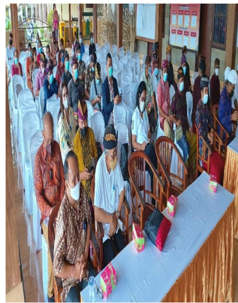
Figure 6. Participants (Partners)

On the other hand, the weaker the individual rights, the stronger the validity of ulayat rights. These individual rights will disappear and the land will return to the power of customary rights if the land is abandoned/turns into thickets or forests again. This refers to the Balon theory (Ballen Theorie) from Ter Haar, which says that the stronger the customary rights, the weaker the individual rights and vice versa (Dharmayuda, 1987). Also referring to Iman Sudiyat stated that the rights of the association and the individual rights of each member influence each other, meaning that they exist in a deflated-expanded relationship, endlessly stretching (Sudiyat, 1981). According to I Wayan Wesna Astara, that the weakness of communal power rights (ulayat rights) in Penglipuran village is influenced by state law politics, the control power of customary prajuru (customary ministers/customary rulers) is less strict/weak, so it is precisely to the holders of Village Lands (PKD), and the AYDs (Tanah Ayahan Desa) occupied by Krama, then without control, that krama secretly certifies the lands.