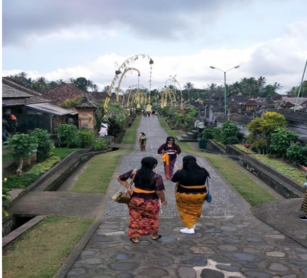
Picture 3 Tourists are selvy

ideologies, the implication is that the culture of the Penglipuran traditional village needs to be preserved (conservation) and developed for civility and prosperity of traditional manners.