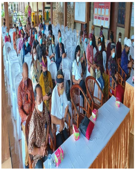
Figure 6. Participants (Partners)

On the other hand, the weaker the individual rights, the stronger the validity of ulayat rights. These individual rights will disappear and the land will return to the power of customary rights if the land abandoned/turns into thickets or forests again. This refers to the Balon theory (Ballen Theorie) from Ter Haar, which says that the stronger the customary rights, the weaker the individual rights and vice versa (Dharmayuda, 1987). Also referring to Iman Sudiyat stated that the rights of the association and the individual rights of each member influence each other, meaning that they exist in a deflated-expanded relationship, endlessly stretching (Sudiyat, 1981). According to I Wayan Wesna Astara, that the weakness of communal power rights (ulayat rights) in Penglipuran village is influenced by state law politics, the control power of customary prajuru (customary ministers/customary rulers) is less strict/weak, so it is precisely to the holders of Village Lands (PKD), and the AYDs (Tanah Ayahan Desa) occupied by Krama, then without control, that krama secretly certifies the lands.