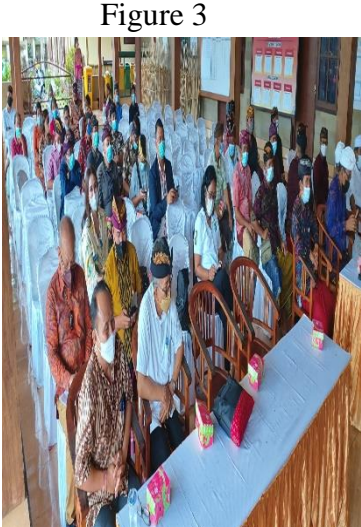
Penglipuran Tourism Village